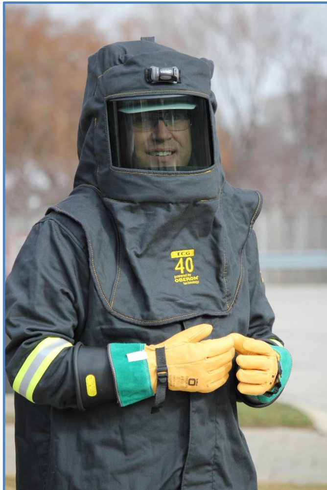
Oberon's TCG40 Arc Flash Suit