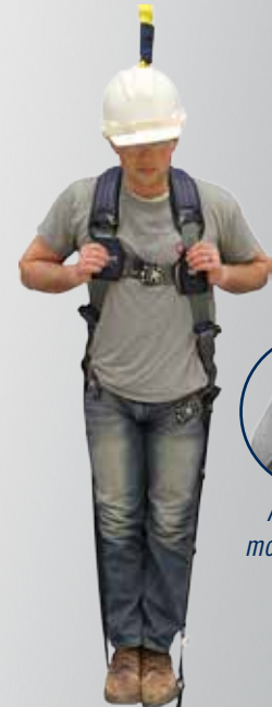
Step 4: Stand up relieve pressure