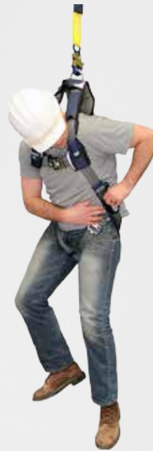
Step 1: Unzip packs to deploy