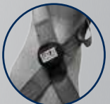
Attaches to most harnesses