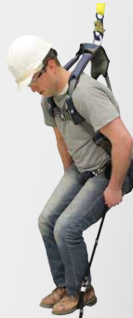
Step 3: Put foot into web loop