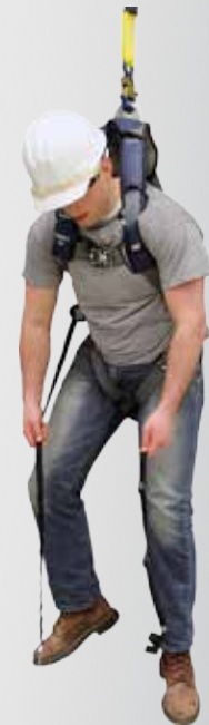
Step 2: Pull out straps and hook