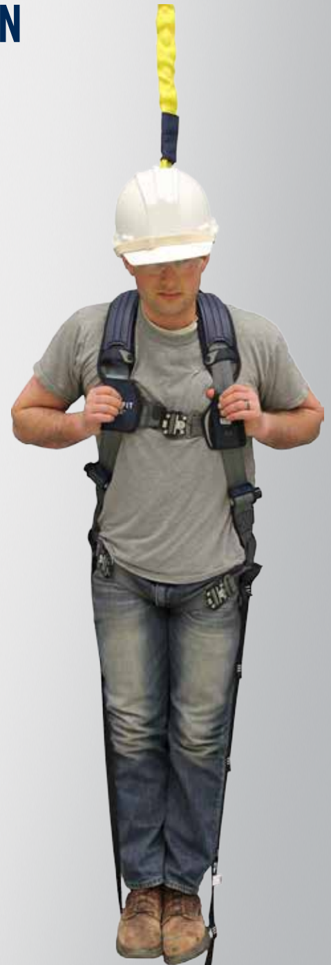
Suspension Trauma prevention